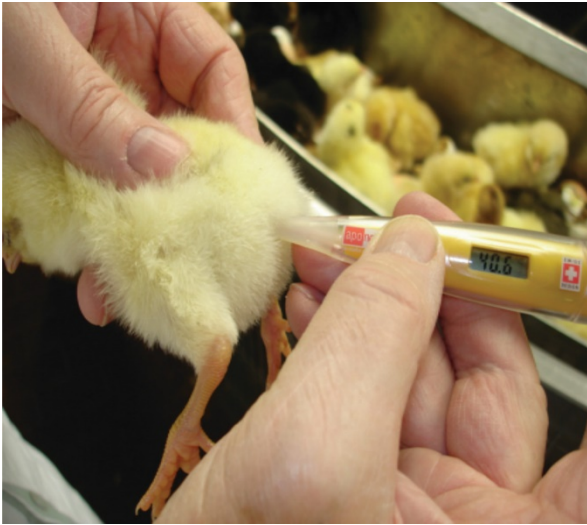
Photo caption: A comfortable internal body temperature of 40-40.6°C needs to be maintained during the first four days and increase to 41-42°C thereafter.