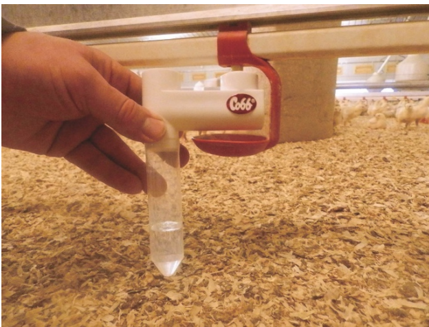
Photo caption: A flow of 40ml per minute is recommended during the brooding phase. Higher flow rates makes it difficult for the chicks to activate the nipples and can also result in more spillage creating wet litter.

Optimizing brooding will unlock the genetic potential of the Cobb 500 broiler – proper management of Feed, Air, Water, Light & Temperature are crucial factors for ideal bird performance. This extra effort during the brooding phase will be rewarded in the final flock performance. ENDS