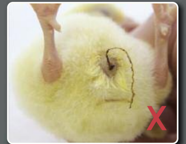
Large/long string navel