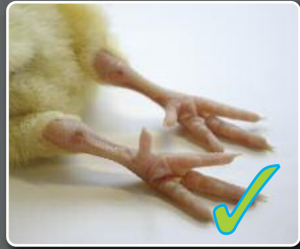
Slight blushing/no abrasion