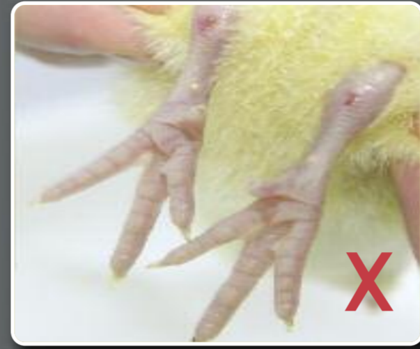
Open cut/abrasion on hocks