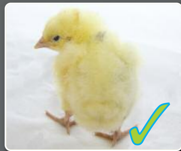
Small grey spot