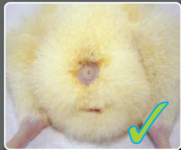
Well healed navel