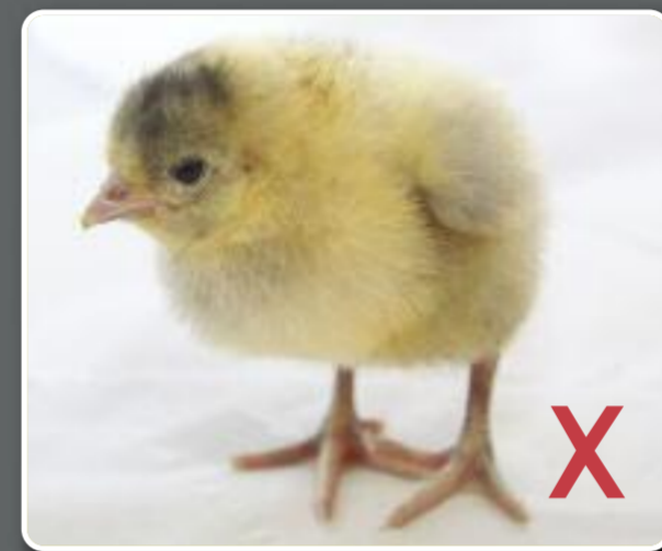
Majority dark grey/black