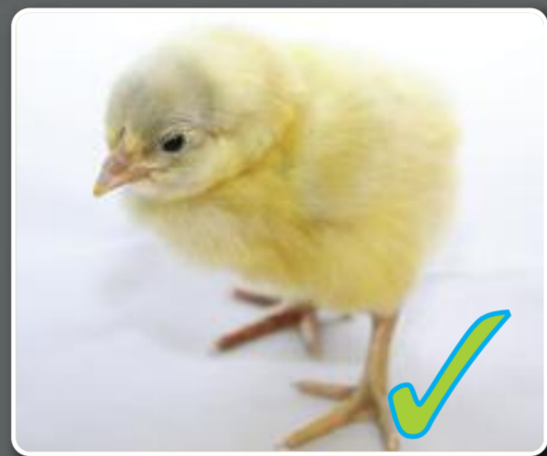
Light grey legs and feathers