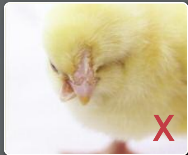
Cross beak/anatomical defects