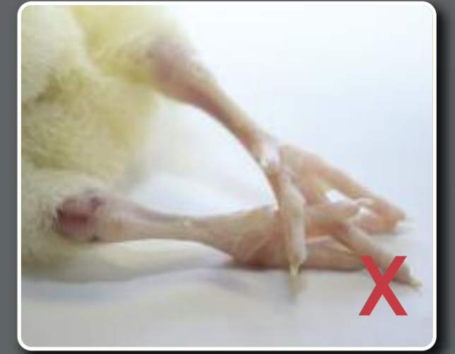
Damage to hocks