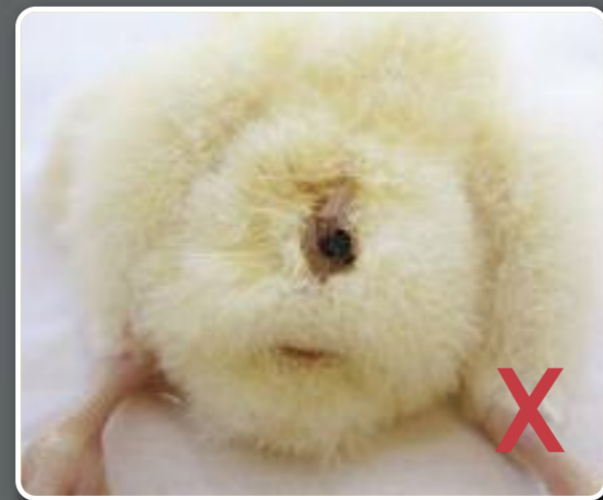
Large button navel